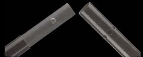
Carbon-fiber ferrule for all take-apart paddles